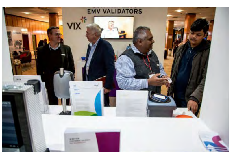
SABOA BUS | No. 4 / 2018 | 8

Vix's fare evasion and monitoring solutions will play a role in ensuring that subsidies flowing down through regional transport authorities go towards